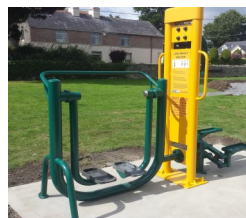
Walker & Stepper on Double-Pole