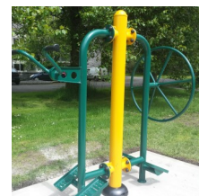
Chin-up Bars & Shoulder Flexor on Single-Pole